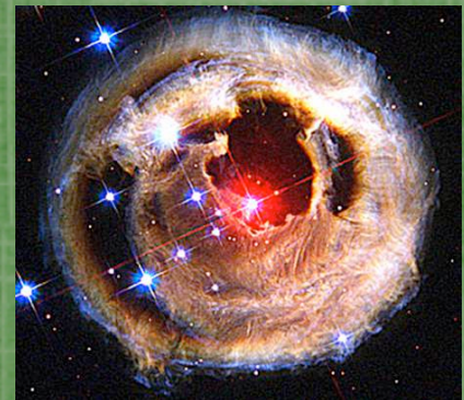
From the Hubble Telescope

Send us your photos and get them in the next Newsletter, mail to: webmaster@lakedoecove.org