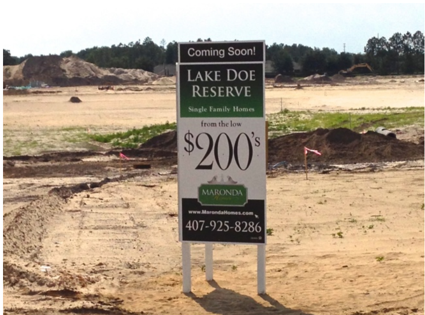
Already trying to sell new homes. If you want to see the houses planned for this development, go to www.marondahomes.com .

real, don’t click on the link. Instead, go to the company website by typing in their Web Address yourself, and then log into your account and make sure everything is OK.