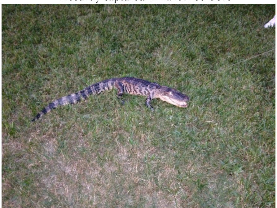
This little 4 foot Alligator was captured behind 473 Yearling Cove Loop in the bushes against the brick wall.